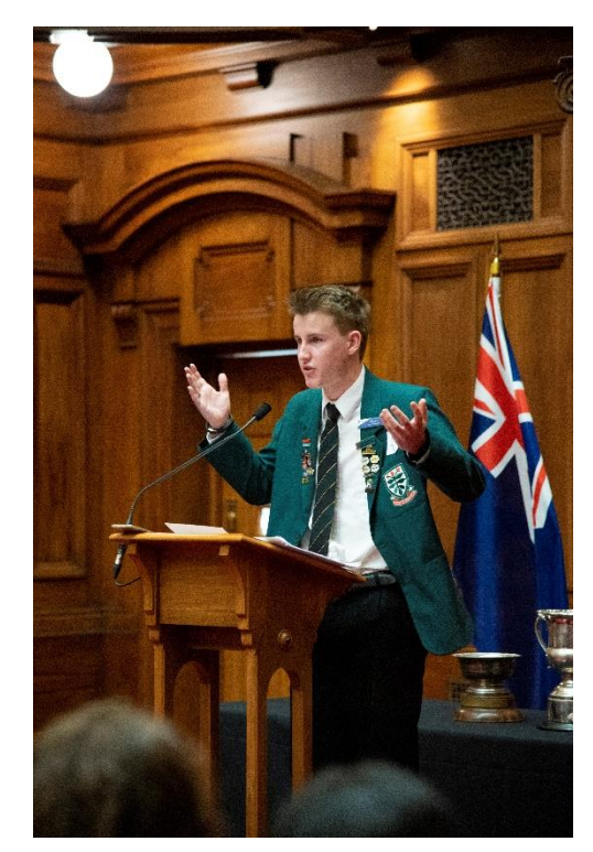
What are the most important skills that are developed through Speech lessons, in your opinion?

In other words, speech training has helped me communicate my thoughts effectively, build the confidence to stand up for what I believe, to understand how different audiences react and thus how to really connect with different groups."